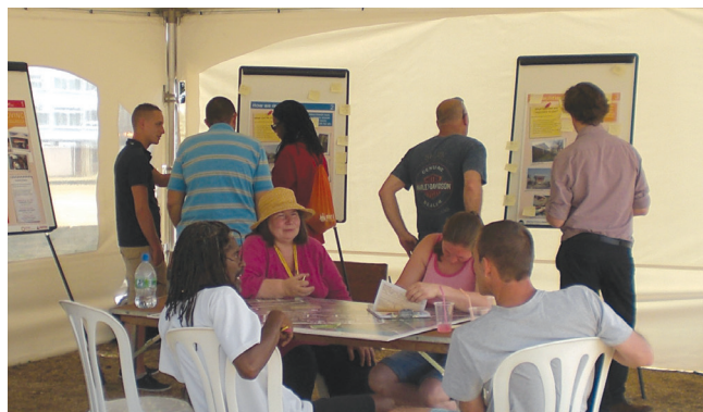
Summer consultation event

We want to develop a plan for Eastfields that uses as many of your ideas as possible. Already we know residents feel it is important to: