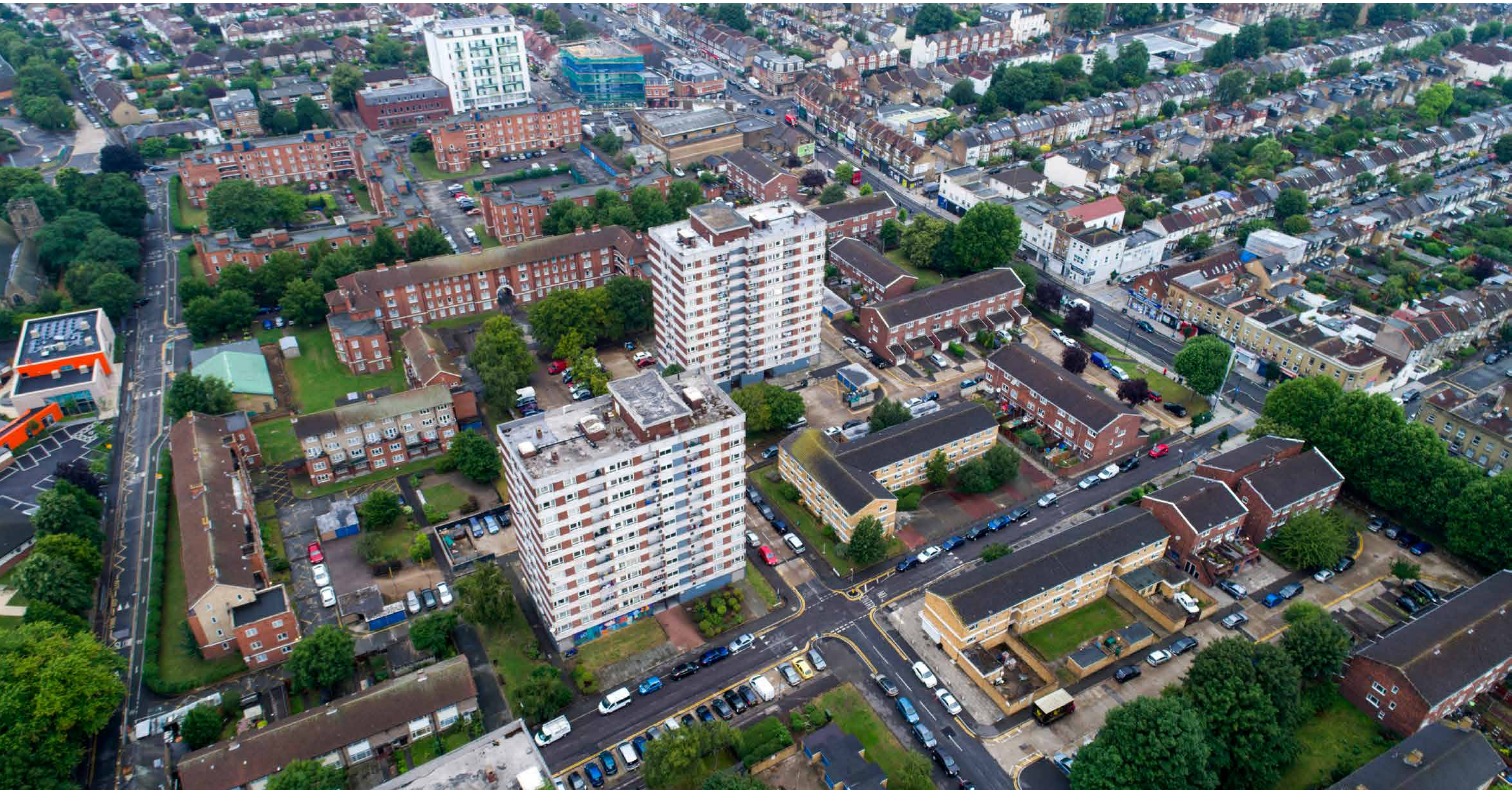
Existing High Path Estate