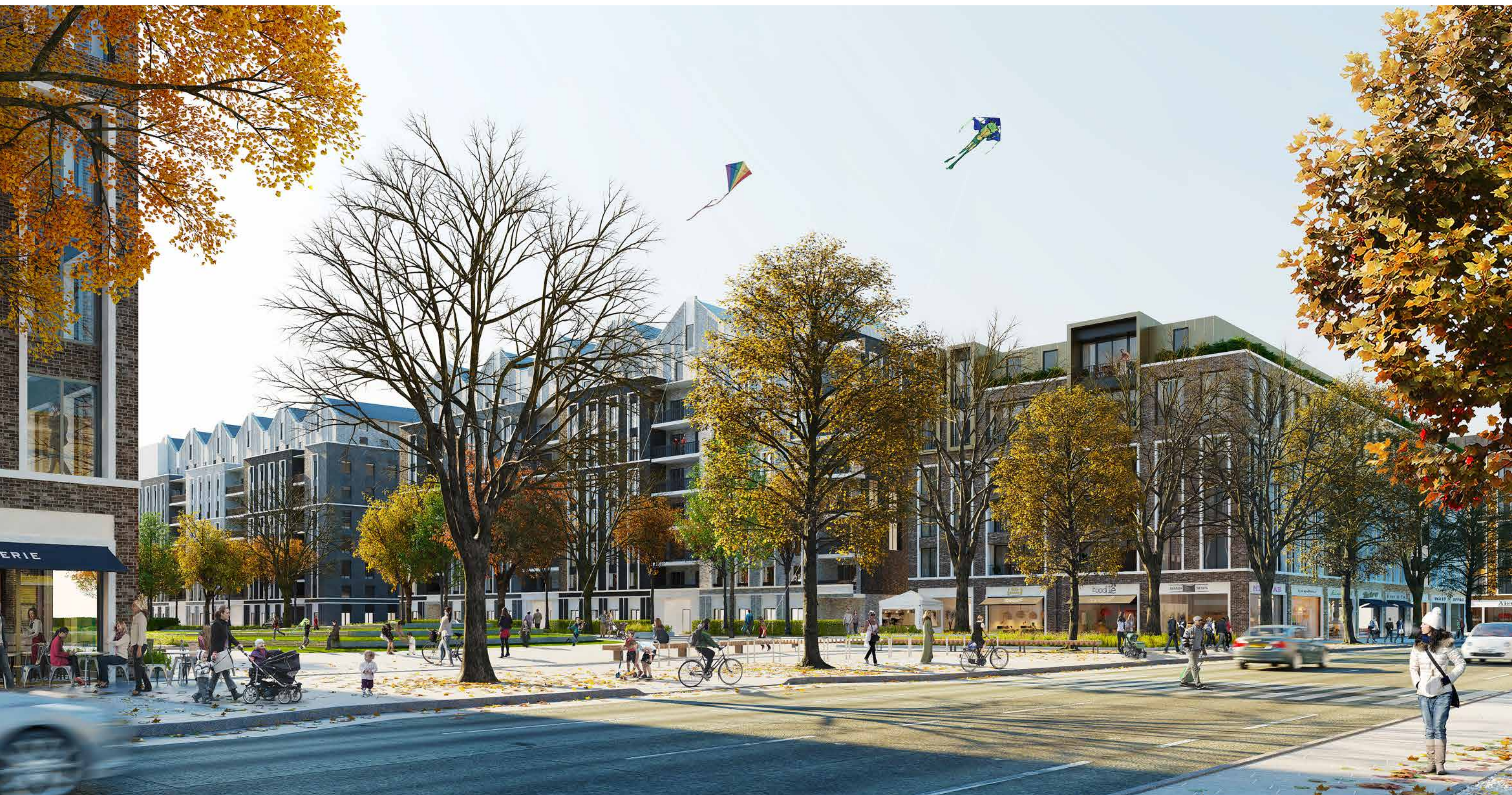
Artist's impression of the neighbourhood park