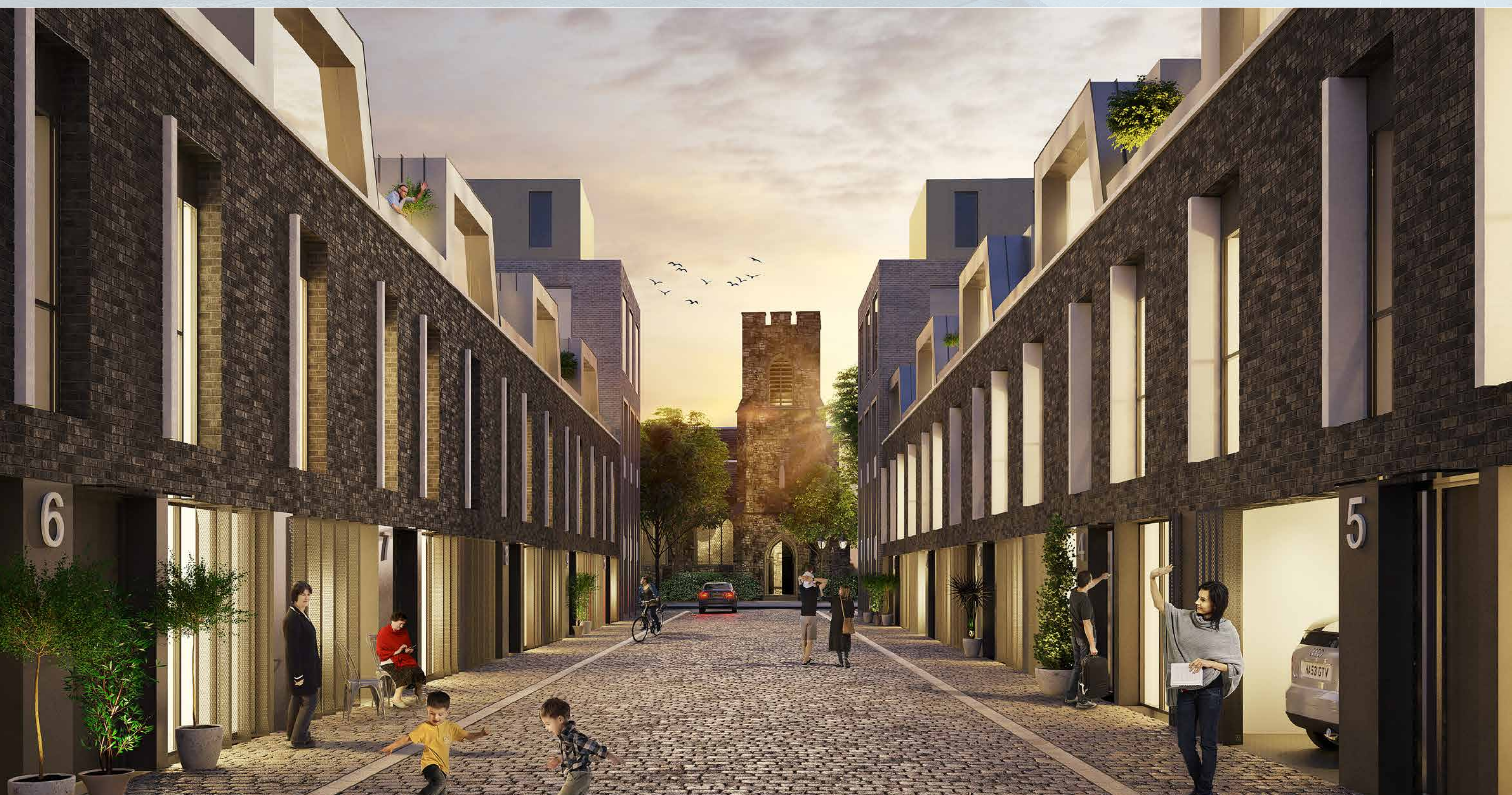
Artist's impression of the news street