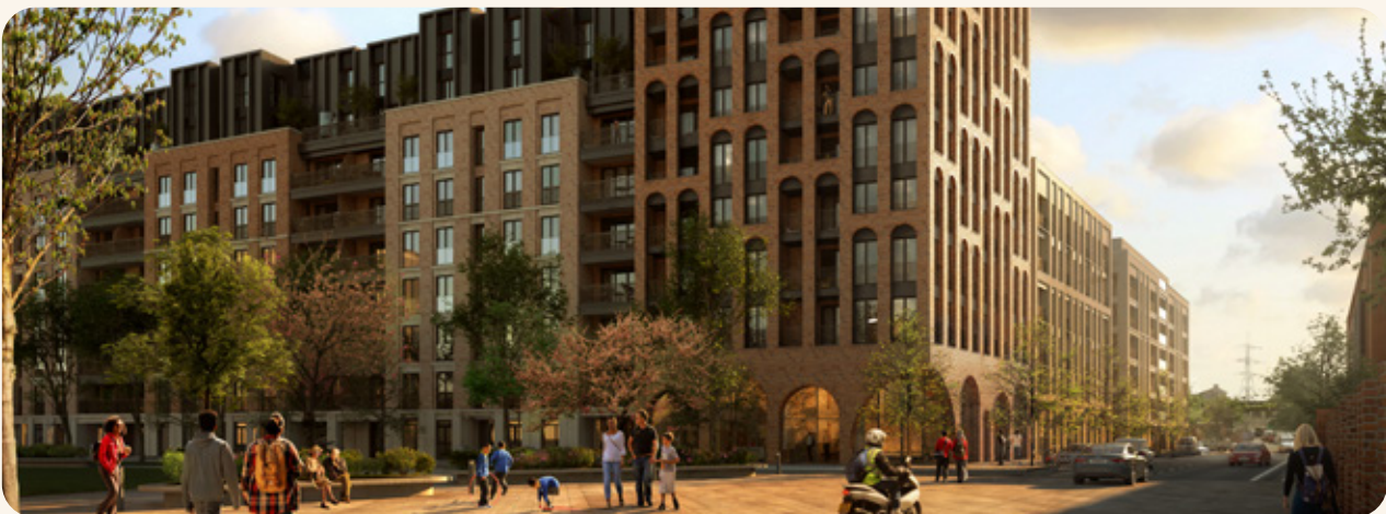
An artist's impression of High Path phases one and two which will exclusively rehouse existing residents, including resident homeowners.

As part of this process, we will be writing to residents in phases two and three and issuing notices under Section 16 of the Local Government Act 1979. This is because we are legally required to confirm your interest in your home (e.g. do you own the property, rent it privately etc.) and other details before the regeneration work on phase two begins. The notice requires you to declare the nature of your interest and the names and addresses of anyone else you believe also has an interest in the property. We will provide more details on how you can respond to the notice nearer the time.