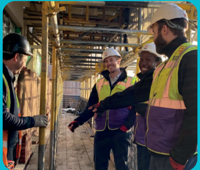
Hill's High Path team includes 11 apprentices

If you are interested please contact highpathjobs@hill.co.uk