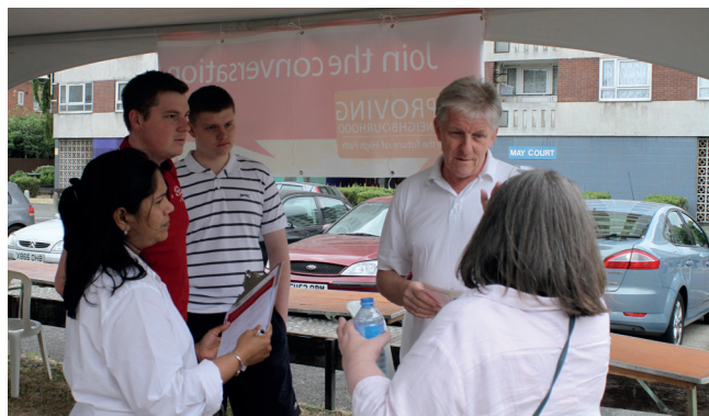
Summer consultation event

There'll be lots of further opportunities for you to raise new points by taking part in our consultation on the initial design stage.