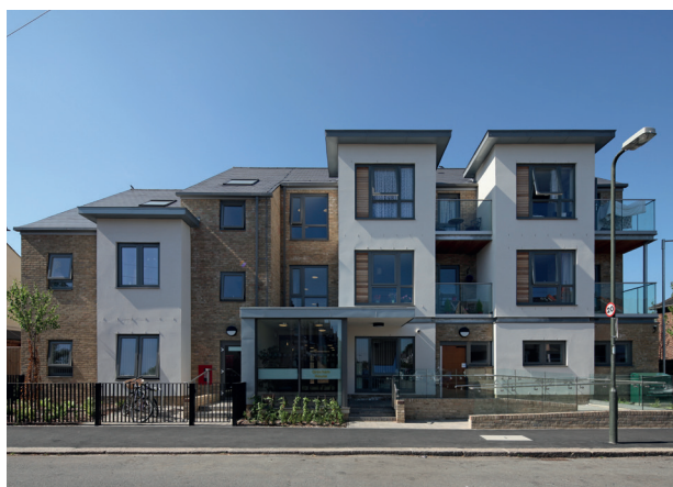
Gresham House exterior

Residents were involved in the designs and consulted at every stage. We also made sure they were supported during the moving process.