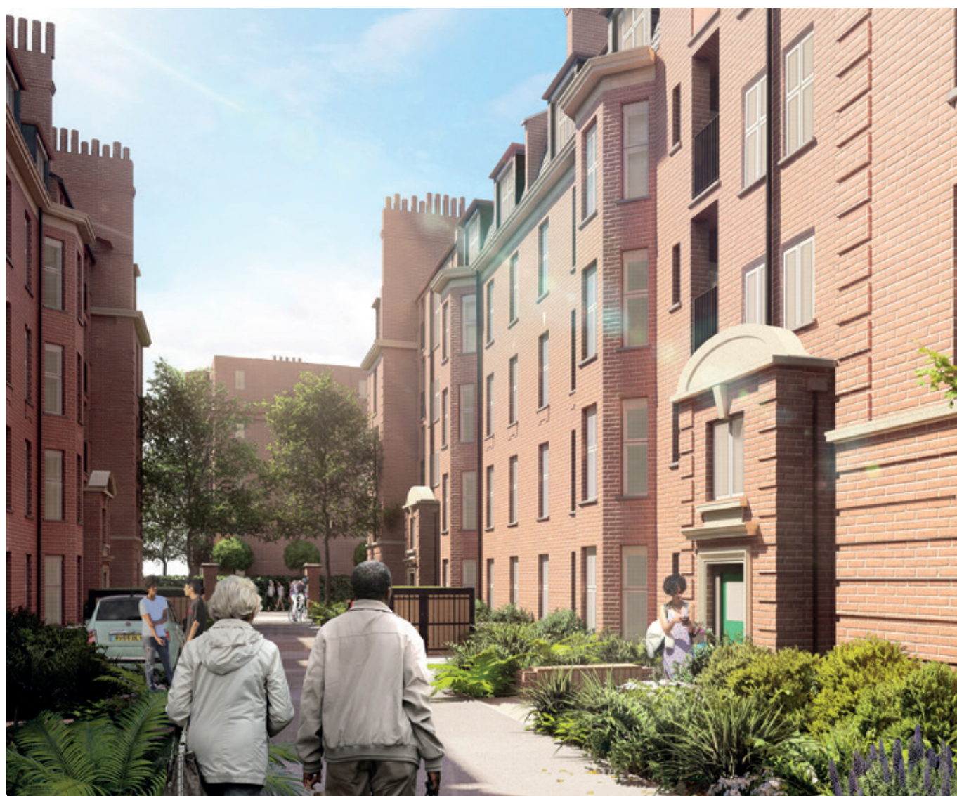
New entrance courts

Lift contractors have been appointed to start upgrade works on the lifts in blocks E to O in the late summer and this will continue until spring 2022.