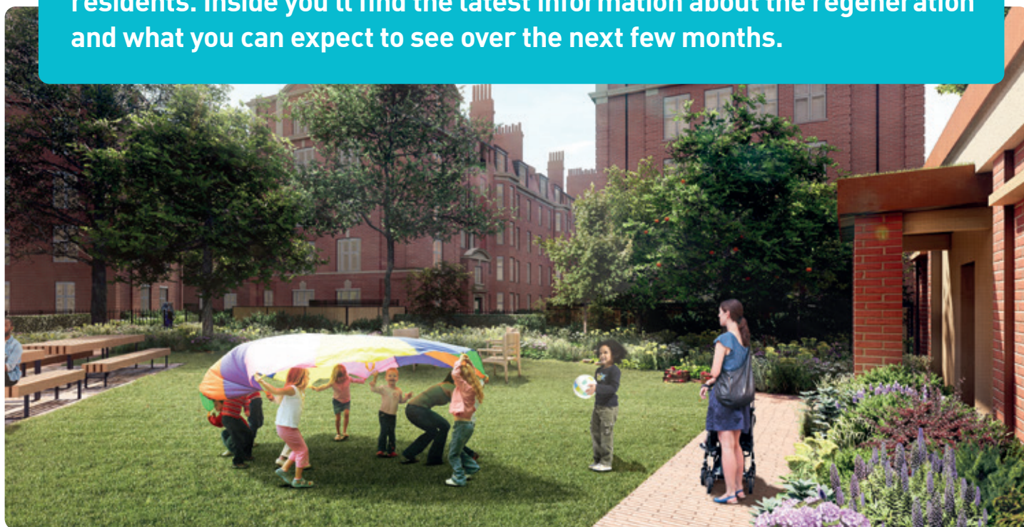
New public realm on site of existing estate office

Welcome to this edition of Chelsea Chat, the newsletter for Sutton Estate residents. Inside you'll find the latest information about the regeneration and what you can expect to see over the next few months.